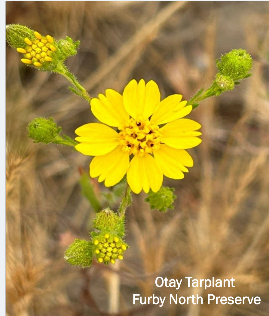
Otay Tarplant Furby North Preserve